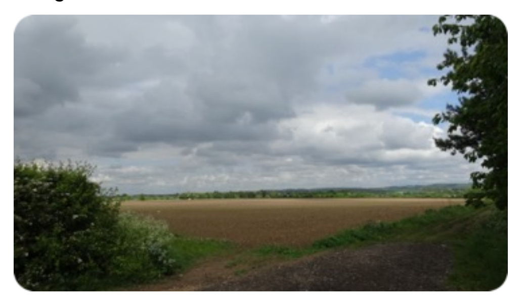
P4. Ilges Lane - South