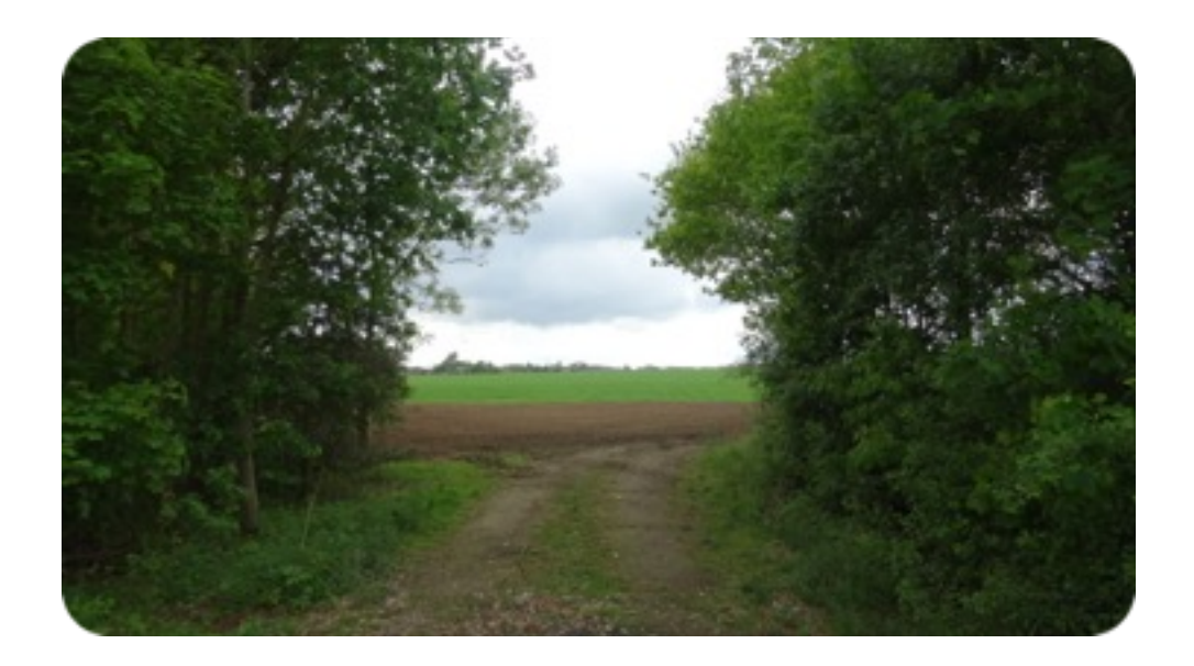
P10. A329 - West