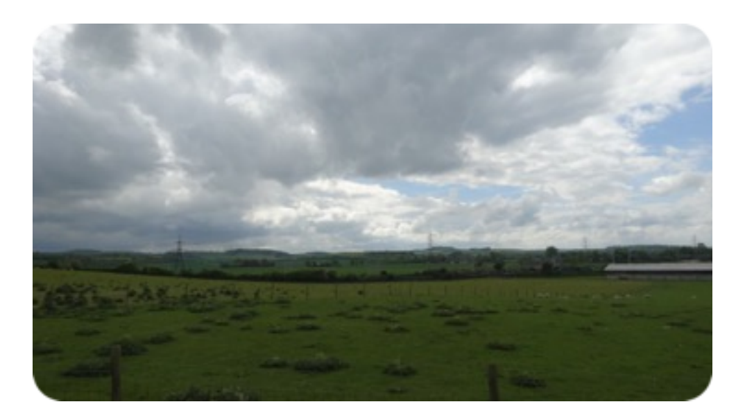
P12. Silly Bridge