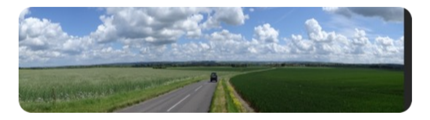
P22. Cholsey Hill

Cholsey hill provides wide expansive views with Manor Farm and buildings. St Mary's Church can be seen in the distance,, whilst the remainder of the village is barely visible, even in winter.